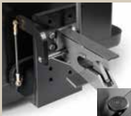
Automatic with Quick Release