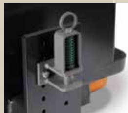
Spring-Loaded Pin and Clevis

Hitches are available in five styles to accommodate the variety of couplers used on towable carts. All hitches are built from premium grade steel for